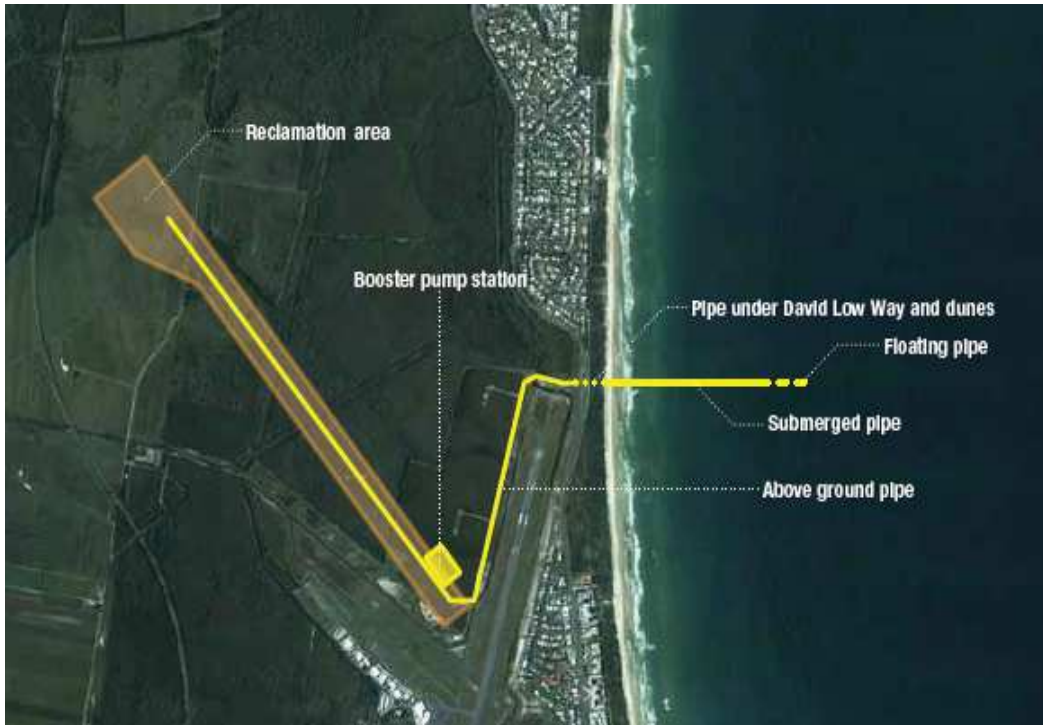
Figure 2- Dredging location and transport route