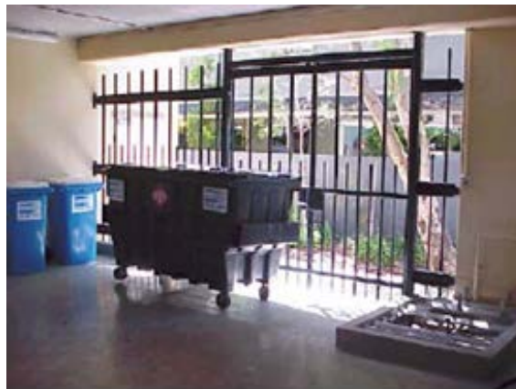
Waste container storage room with wash down area.

Note—Council may require or accept specialised equipment in some circumstances, such as compaction equipment to minimise storage areas. Compaction equipment may be accepted for the following wastes:-