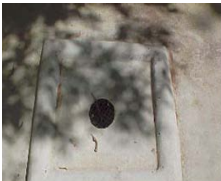
Bunded bin wash down area in further detail.