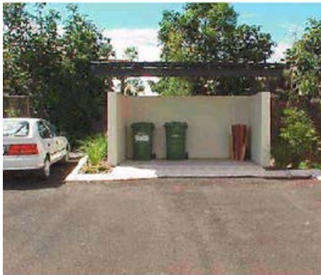
Roofed waste storage container area for 240 litre bin type.