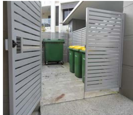
Screened waste storage container area with bunded bin wash down area.