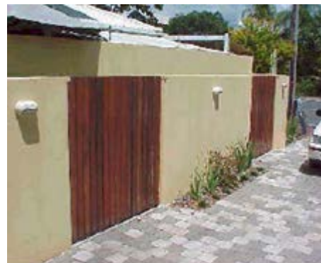
Streetscape screening to waste container storage area serviced via street.