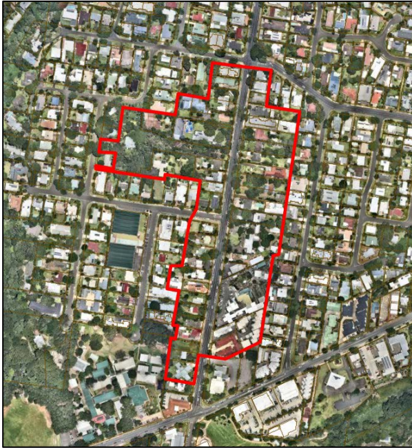
Figure 1: Aerial view of subject land