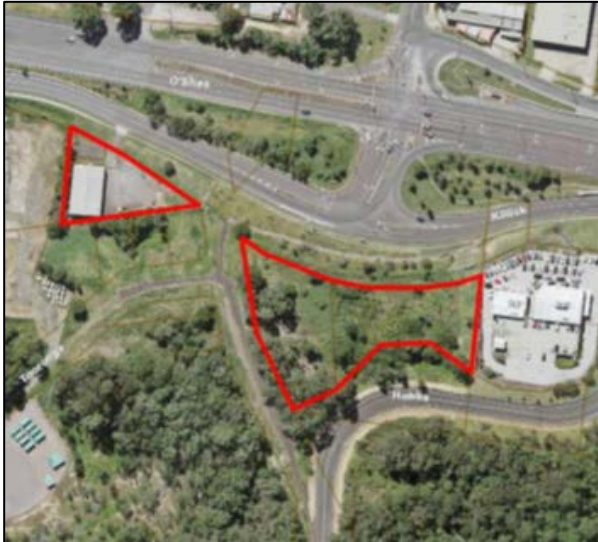
Figure 1: Aerial view of subject land