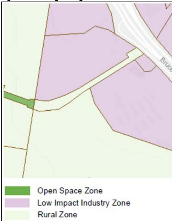
Figure 2: Existing zoning

The subject lands inclusion in the Rural zone is considered to be an error, particularly given that there is an existing industrial use on the subject land and is adjoined by land included in the Low impact industry zone.