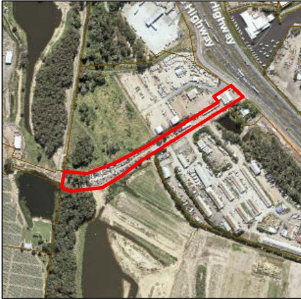
Figure 1: Aerial view of subject land