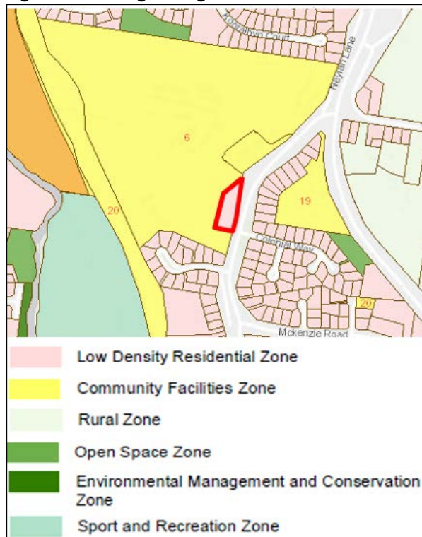
Figure 2: Existing zoning

The subject land is owned by the adjoining Nambour Christian College. The Nambour Christian College proposes to make alterations and additions to the existing building on the subject land for purposes consistent with an Educational establishment.