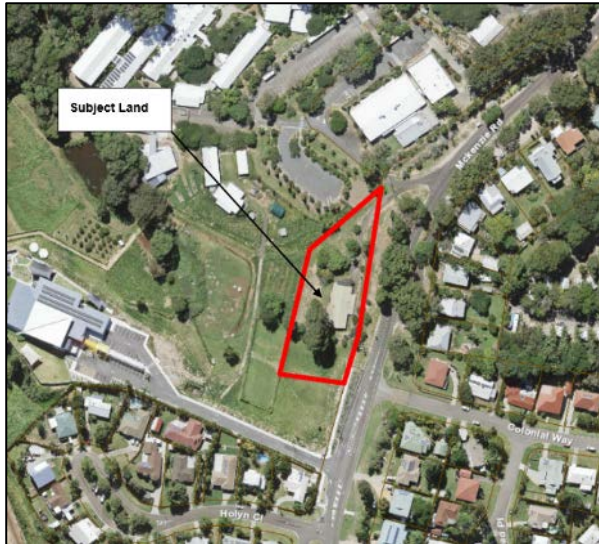
Figure 1: Aerial view of subject land