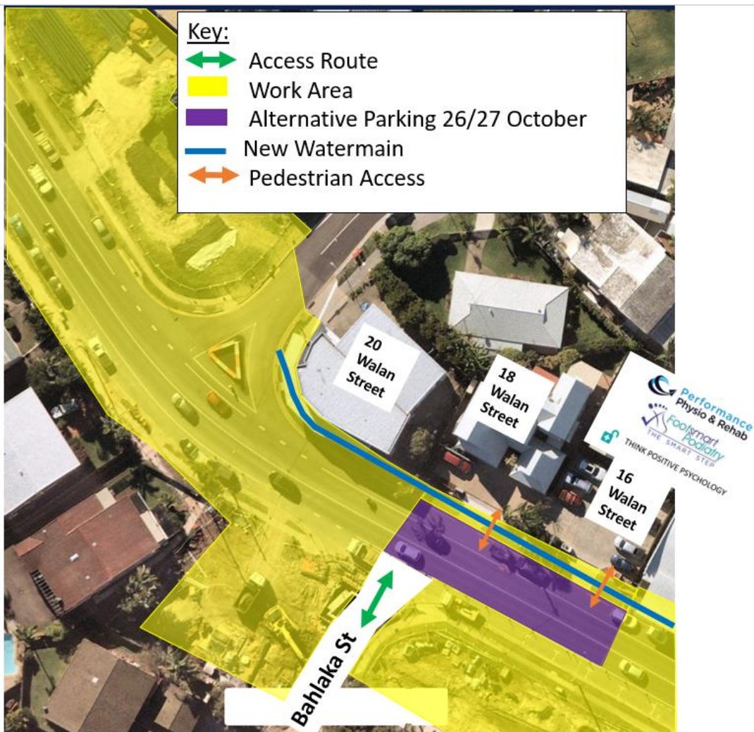
Figure 2 – locations of water main works and alternative parking Monday 26 and Tuesday 27 October.