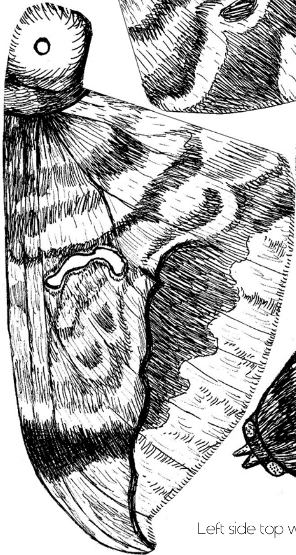
Left side top wing