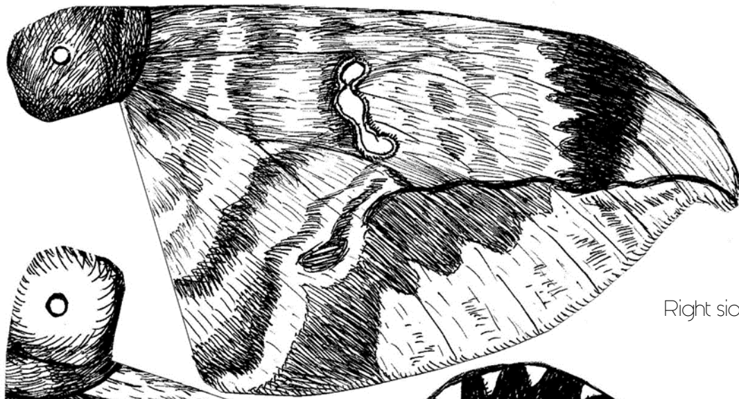
Right side top wing